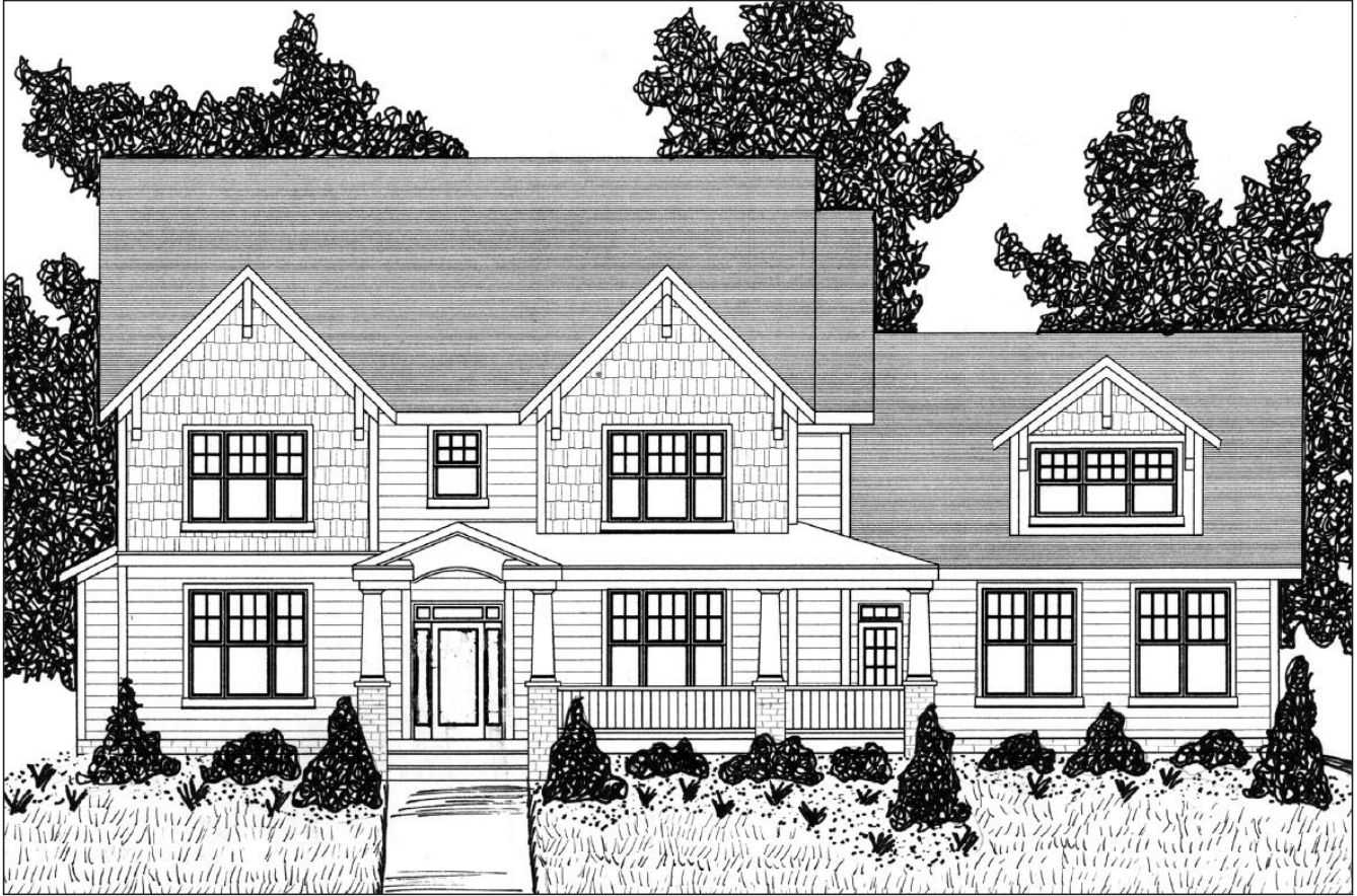
the Whitney Redding plan Approximately 3311 square feet